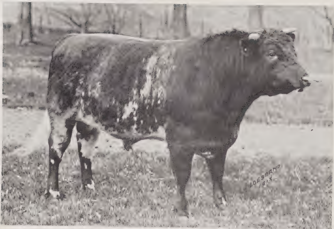
SULTAN'S CROWN 363114.